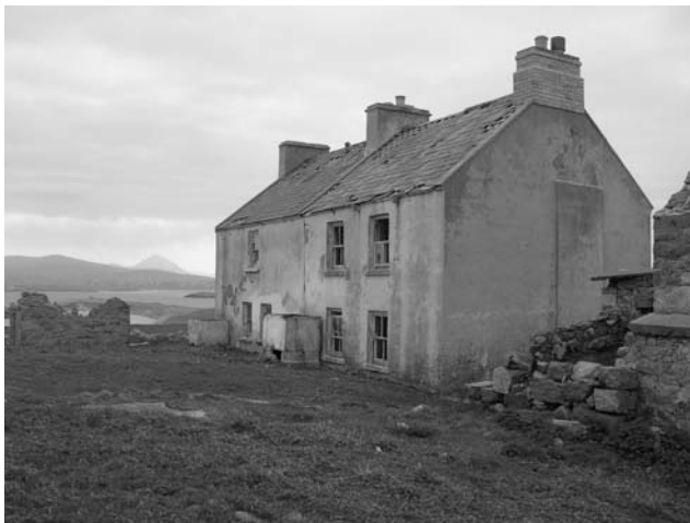
House on Gola Island

Traditional dwellings form an important visual and cultural contribution to the character of our landscapes. However most of these buildings are offered no protection and many are being replaced with inappropriate modern houses. Though largely without services, many of these vacant dwellings are capable of being refurbished to high standards for modern living.